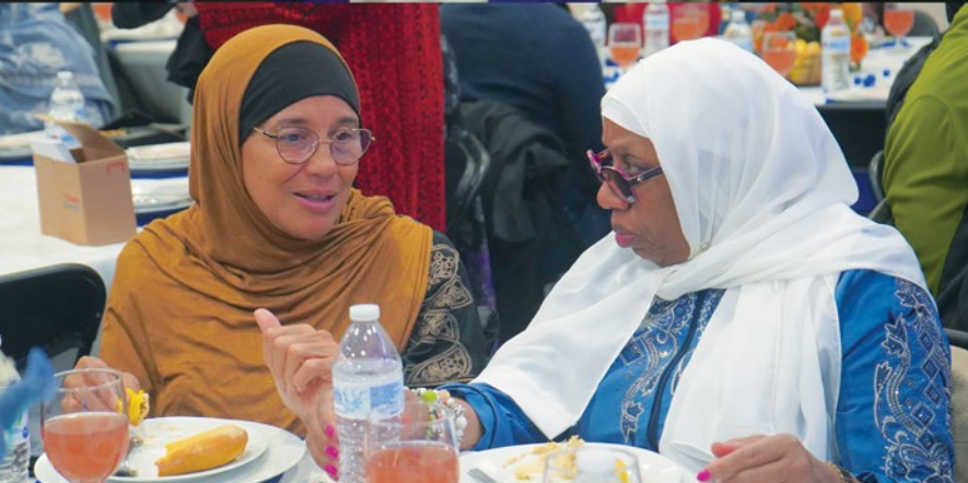
Guests at our annual banquet. Read more on page 10.