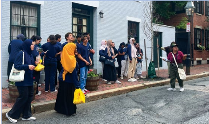
MYLP In front of the Museum of African American History, during the Black Heritage Trail tour.