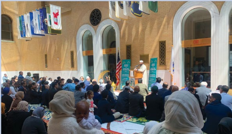
Massachusetts Muslims filled the State House for an historic celebration.