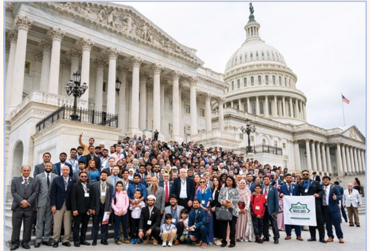
CAIR-MA joined Muslims from across the country for Muslim Lobby Day at the U.S. Capitol in Washington, D.C.