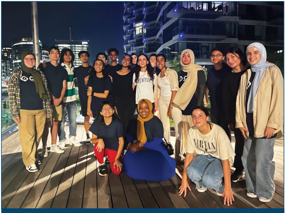
After daylong workshops, MYLP participants took a lovely evening walk to Boston's Seaport District to enjoy the summer breeze and beautiful city views.

In August, CAIR-MA was proud to host our 5<sup>th</sup> annual Muslim Youth Leadership Program (MYLP) in Boston — our first in-person gathering after two years of virtual programs. MYLP, a four-day intensive leadership program for Muslim high school students in Massachusetts, engages young Muslims to be changemakers in their communities. Our 28 participants spent four days building their community organizing, public speaking, and media literacy skills. They learned about trauma-informed civic engagement and the impact Islamophobia has on the lives of Muslims, civil rights, civic engagement, and much more. Our participants also had the opportunity to connect with MYLP alums at our first-ever alumni ice cream social and panel discussion, "Where are MYLP alums now?"